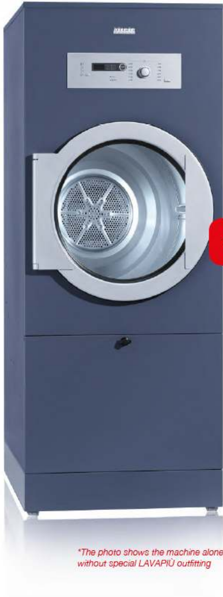
← PT 8301 Slim SmartLine